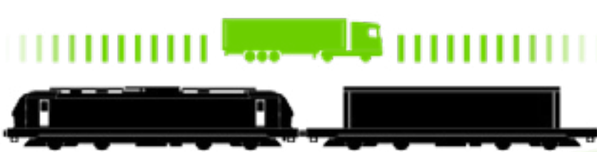
Intermodal – Continental Road Rail Logistics