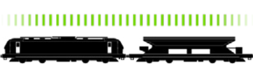
Rail Freight Rail Freight Logistics

Nature benefits when long distances are covered by rail. We translate that fact into intelligent concepts and offer the entire portfolio of conventional and combined transport by combining the strengths of the various modes of transport. Long distance by rail, short distance by road. That is „Green Excellence“. We act as an integrator: As a traction company, we enable companies to achieve their goals by rail. As an operator, we define efficient routes across all modes of transport and create green corridors throughout Europe together with our partners.