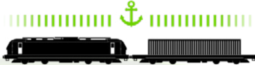
Intermodal – Maritime Ocean Rail Logistics